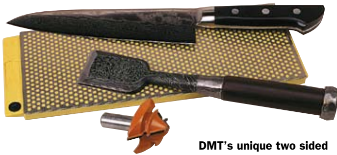
DMT's unique two sided DuoSharp Whetstones.

Sharpening with DMT's diamond whetstones is quick and easy. Woodworkers save at least 90% of sharpening time putting an edge on a chisel in only a few strokes. All are flat lapped and most are around 1/1000" total indicated readout. DMT whetstones resist bending, grooving or breaking, and will last for many years with normal use. The impressive range of DMT means that all manner of tools can be sharpened. Gouges, chisels, lathe tools, garden tools, knives, plane irons, router bits, etc, which make your purchase of DMT easy to justify. The DMT® revolutionary DuoSharp™ offers considerable cost saving with the convenience of a two sided diamond precision stone, simply turn the stone over to change grits. In effect you get one side for free! These stones are the ultimate in precision flatness.