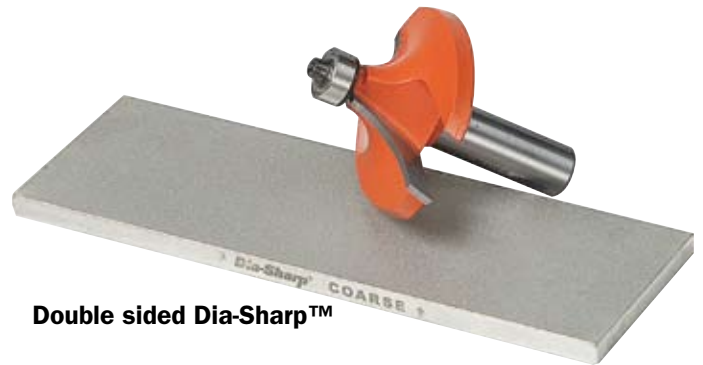
Double sided Dia-Sharp™

DMT Double Sided Dia-Sharp™. Combines two grits in the same stone. Fast and easy way to sharpen any tool.