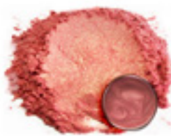
ECC-01094-25 PACHINKO RED YELLOW