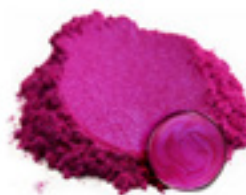
ECC-01035-25 WISTERIA PURPLE