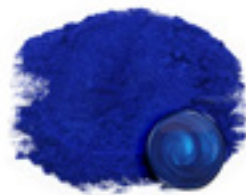
ECC-01190-25 PERSIAN PURPLE