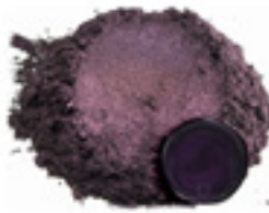
ECC-01037-25 DARK UBE