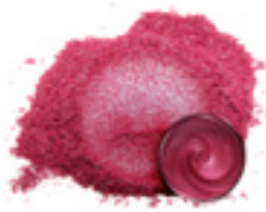
ECC-01027-25 BENIIMO RED