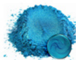
ECC-01055-25 SORA IRO