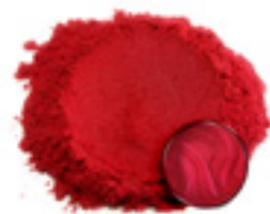
ECC-01185-25 BAKU RED