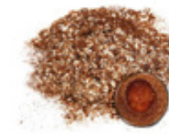
ECC-01210-25 VIBRANT BRONZE