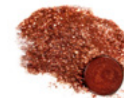
ECC-01211-25 PENNY COPPER