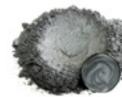
ECC-01065-25 SHADOW GREY