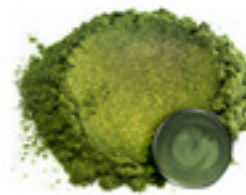
ECC-01081-25 MATCHA GREEN