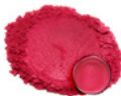
ECC-01031-25 KYOTO RED