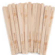
High-Quality Mixing Sticks