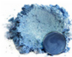
ECC-01124-25 ICEBURG BLUE