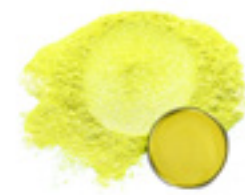
ECC-01022-25 MUSTARD YELLOW