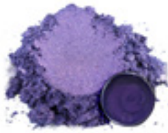
ECC-01127-25 PURPLE SAGE