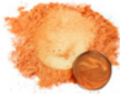
ECC-01101-25 FIRE ORANGE