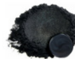
ECC-01063-25 NINJA BLACK