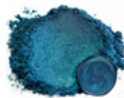
ECC-01130-25 MACAW BLUE GREEN