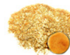
ECC-01180-25 GOLD NUGGET