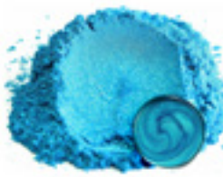
ECC-01078-25 OKINAWA BLUE