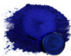
ECC-01434-25 NOKON DARK BLUE