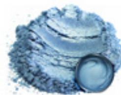
ECC-01039-25 CAROLINA BLUE