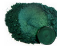
ECC-01050-25 DARK OCEAN GREEN