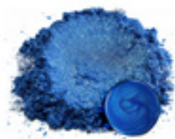
ECC-01043-25 OCEAN BLUE