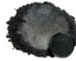
ECC-01088-25 SAMURAI BLACK