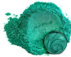
ECC-01052-25 OKINAWA GREEN